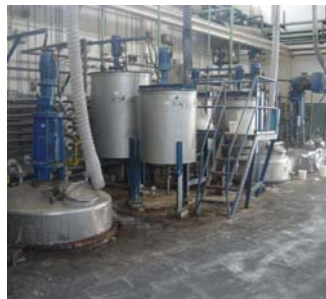
Resin production process