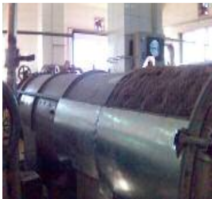
Insulation of sterilizer using rock wool and aluminium foil (implemented CP measure)

Those are some benefits gained from the implementation of the CP options and measures: