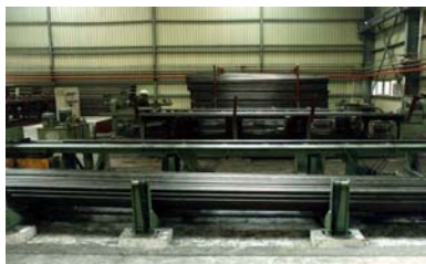
Implemented CP measure at the Hot Dipping Galvanizing Line

The CP team focused at galvanizing unit, where many options have been identified. Some of these options have been implemented such as: minimizing losses from degreasing bath, repairing the isolation of the steam pipes, preventing leakages in steam valves and junctions, using a new additive material to prevent ash formation, using organic passivation material instead of chromium, and conducting training for employees to improve process quality control.