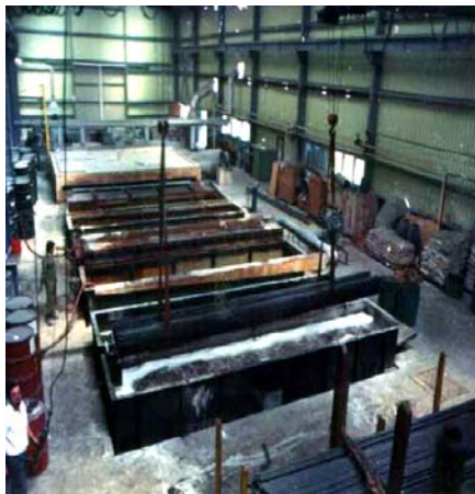
Hot Dipping Galvanizing Line