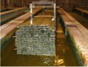
Replacing the hexa-valent chromium by chromium free substance in the powder coating line

Benefits gained from the implementation of the CP options and measures are: